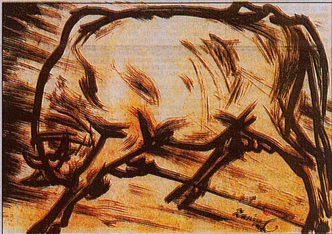
Rebellion, brush and ink

The sketches are powerful and often not seen before.