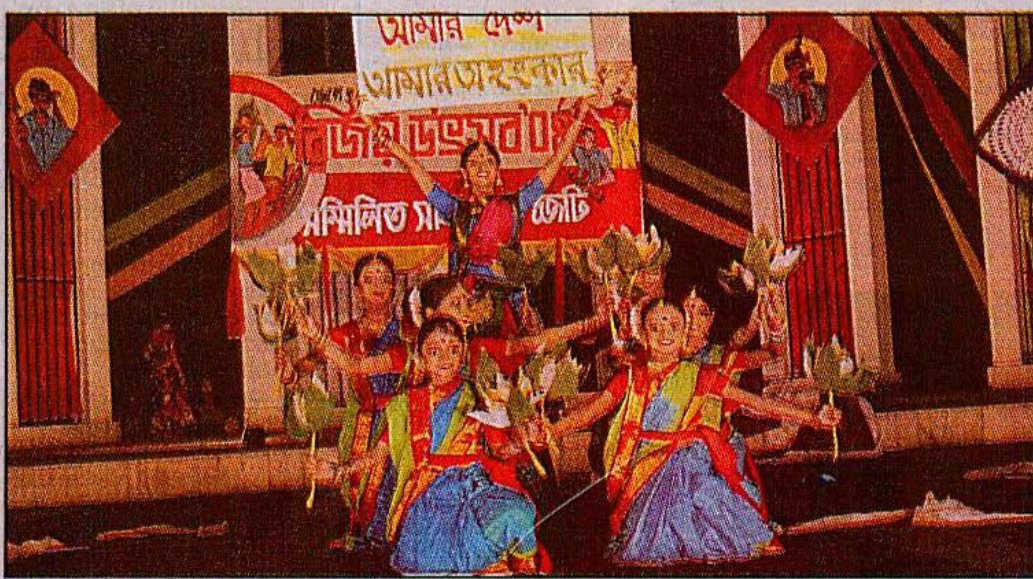
Little dancers of Spandan performs to the beat of a patriotic song

'Our spirit of Liberation War should be guarded against the anti-