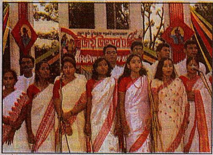
A cultural group presents a chorus