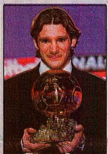
AC Milan's Ukrainian superstar Andriy Shevchenko poses with the Golden Boal trophy in Paris on December 13 after being awarded as European Footballer of the Year by the French sport magazine France football.