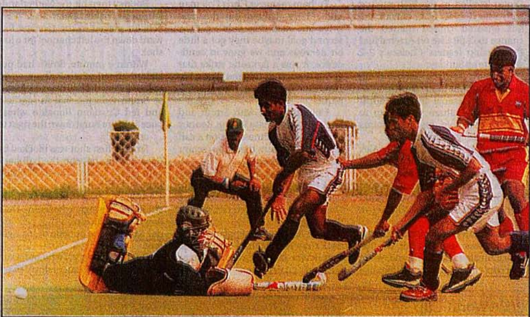
A Mariner Youngs attack at the Azad goalpost during their Green Delta Premier Division Hockey League encounter at the Maulana Bhasani National Stadium yesterday.