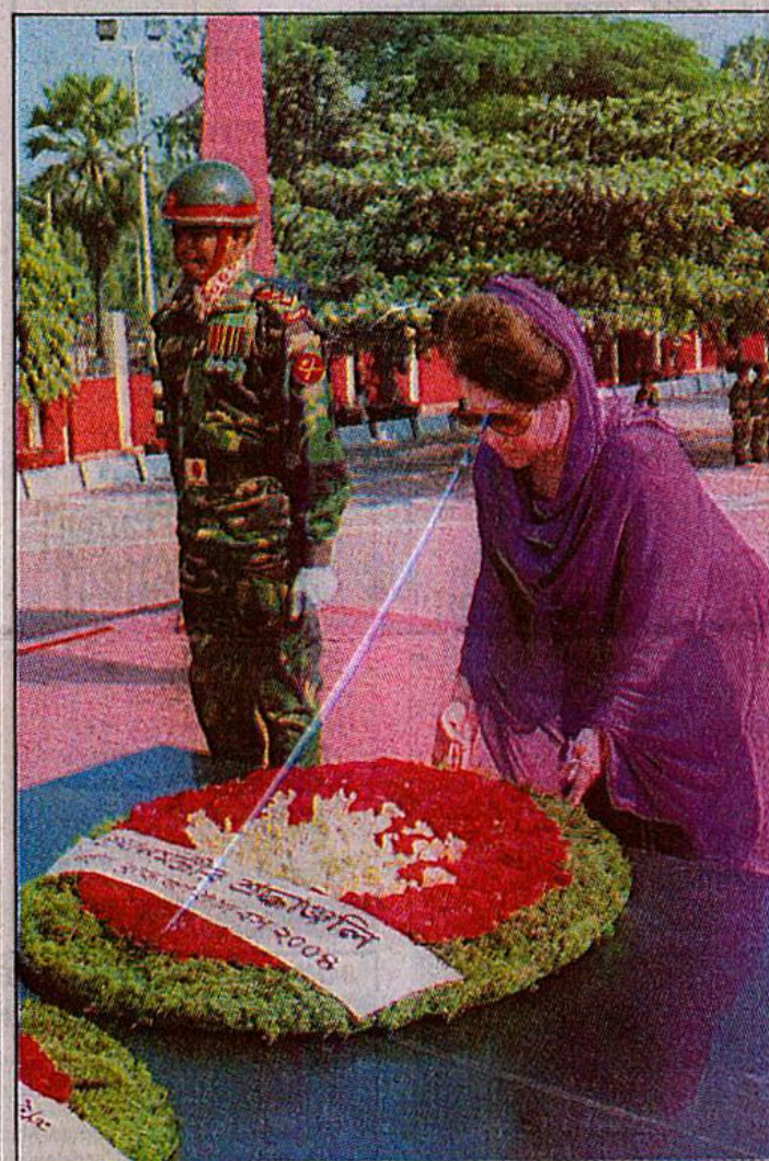
Prime Minister Khaleda Zia places a wreath at the Martyred Intellectuals Mausoleum at Mirpur in Dhaka yesterday in homage to the intellectuals martyred days before Bangladesh's liberation.