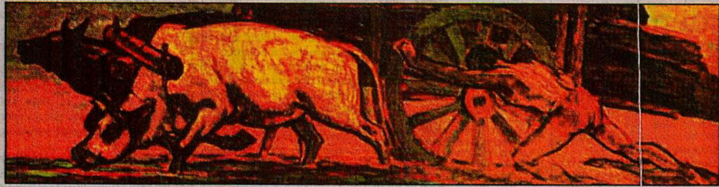
One of Zainul's priceless creations

Celebration of Shilpacharya's 90th anniversary begins