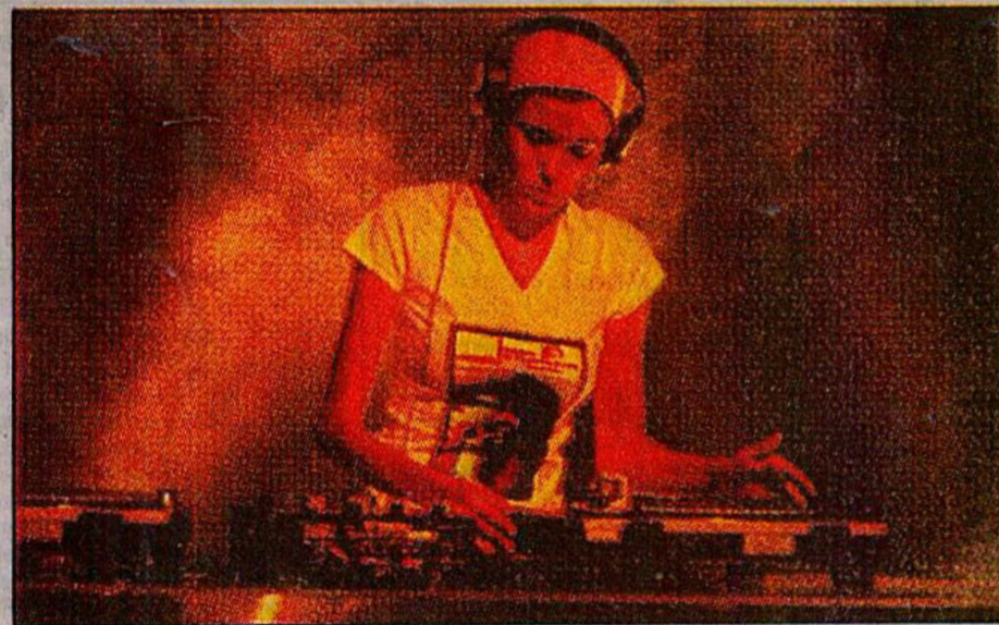
Kwaito Culture by Neo Ntsoma

All the pictures are a celebration of the new generation of South African youth.