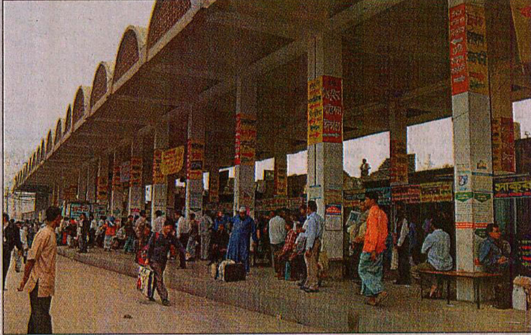
Some 127 makeshift stalls stopped their business due to the construction work that deprived the company from daily toll. The officials claimed collection decreases as some transport companies having close link with the ruling party do not pay the tolls. Khaleque Enterprise,

Collection from public toilets and car washing are nil as those are under construction. "We are supposed to get toll from the telephone booth which is also under construction," said Nurul Islam.