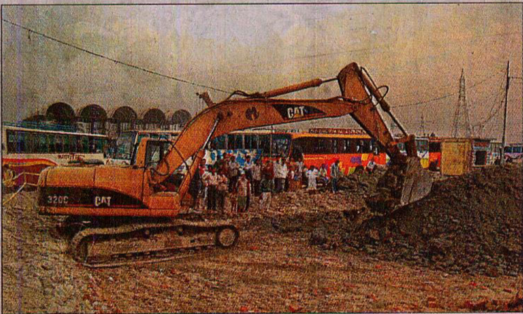
Construction and renovation work on the Gabtoli terminal with more facilities for passengers is underway.