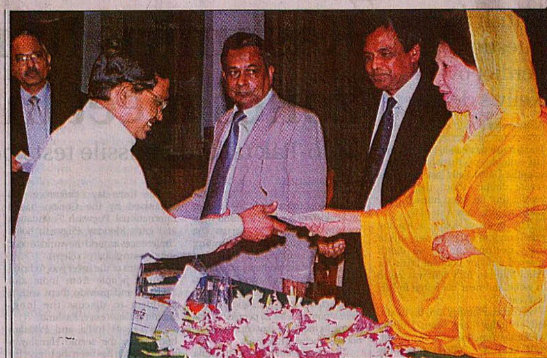
Prime Minister Khaleda Zia distributes cheques among the employees who went on voluntary retirement and the retrenched factory workers under a rehabilitation programme at the Osmani Memorial Hall in the city yesterday.