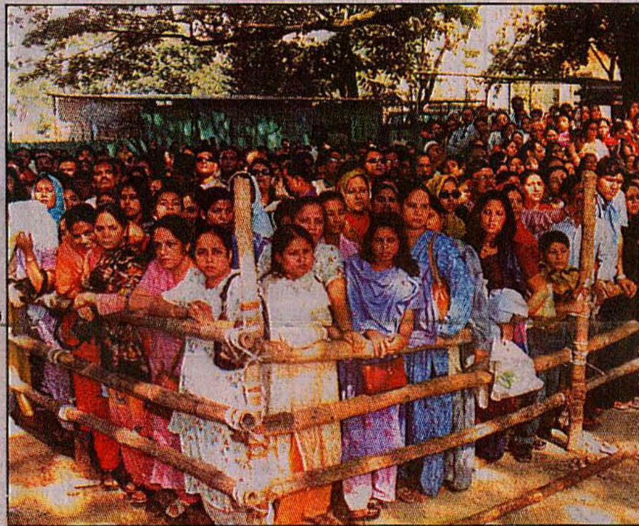
Guardians, left, of kids sitting the admission test to Class I at Viharunisa Noon School in the capital yesterday wait anxiously in an enclosure on the campus, while a child breaks into sobs in an examination room unable to cope up with the stress.