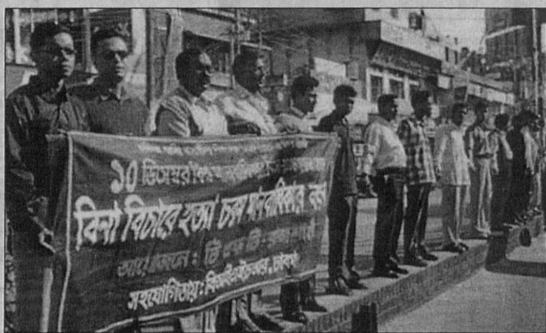
Marking the World Human Rights Day, Taskforce Against Torture, a local NGO, formed a human chain in Rajshahi city on Friday protesting detention without trial.