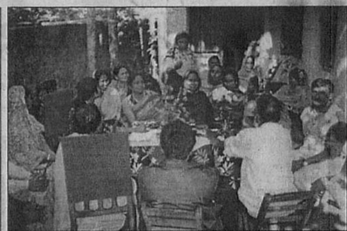
Women Union Parishad members arguing with UP chairmen for work and their rights at a meeting held at Bauli UP office.