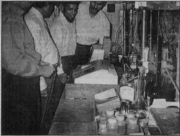
An inside view of the vehicle mounted soil testing laboratory at PSTU.