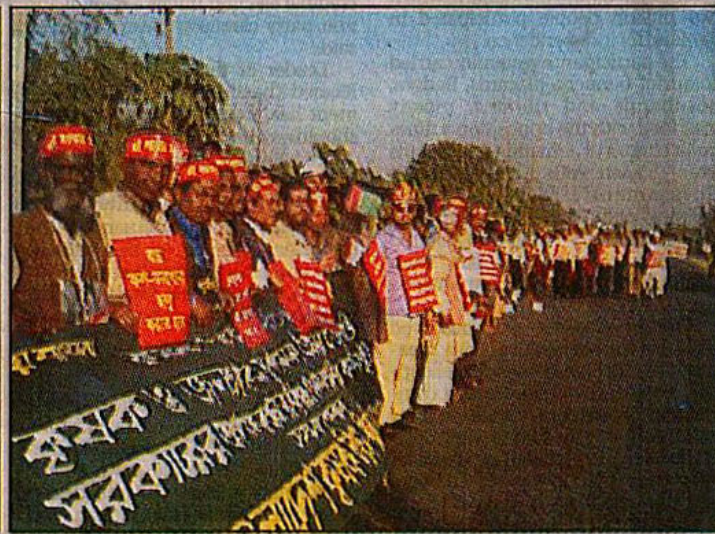
Leaders, activists and supporters of the main opposition Awami League and its allies stand hand in hand, from left, at Muktangan in the capital, the hill district of Bandarban, the port city of Chittagong and the north-western town of Syedpur yesterday. The 14-party opposition line-up formed, for the first time ever, the 1,000km cross-country human wall as an expression of no-confidence in the BNP-led four-party coalition government.