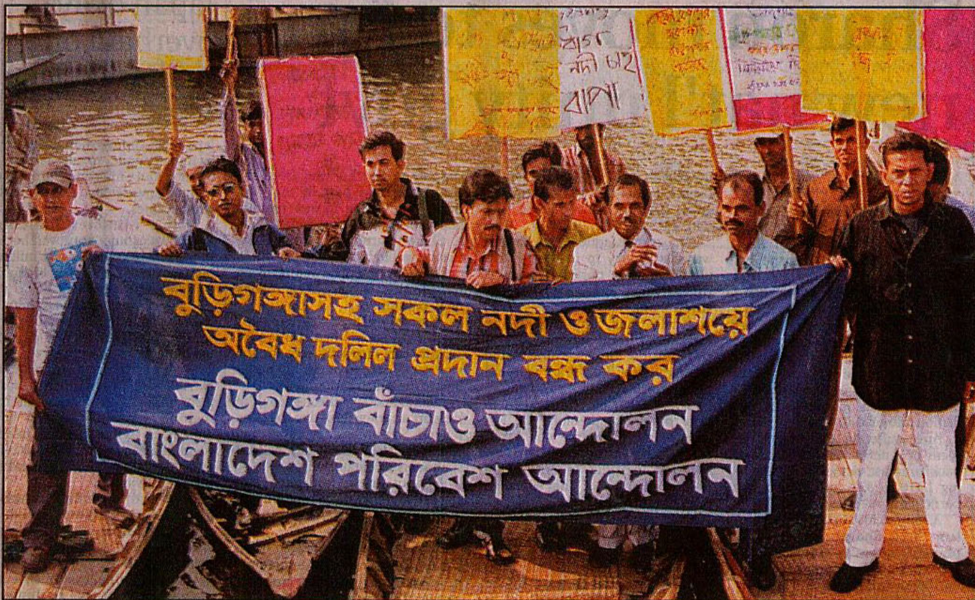
Environmental activists hold a banner and placards during a boat rally at Sawarighat in the city yesterday. Bangladesh Paribesh Andolon organised the rally demanding steps to save the Buriganga from illegal encroachers.