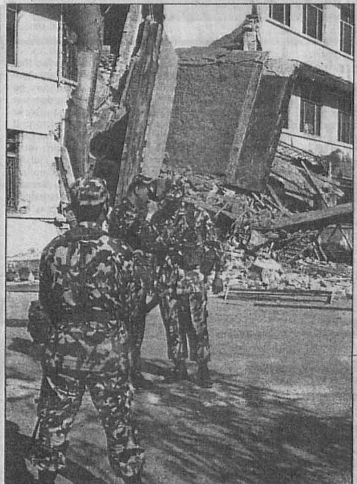
Nepalese soldiers and a policeman stand guard outside a bomb damaged building in the Kuleswori District of Kathmandu yesterday. A powerful bomb went off at the offices of the agriculture marketing private company, badly damaging the three-story building, but without injury to anyone.

"In the international arena, men are frightened and shocked by arms rivalry, the gap between rich and poor and bullying of the weak by the strong," he said.