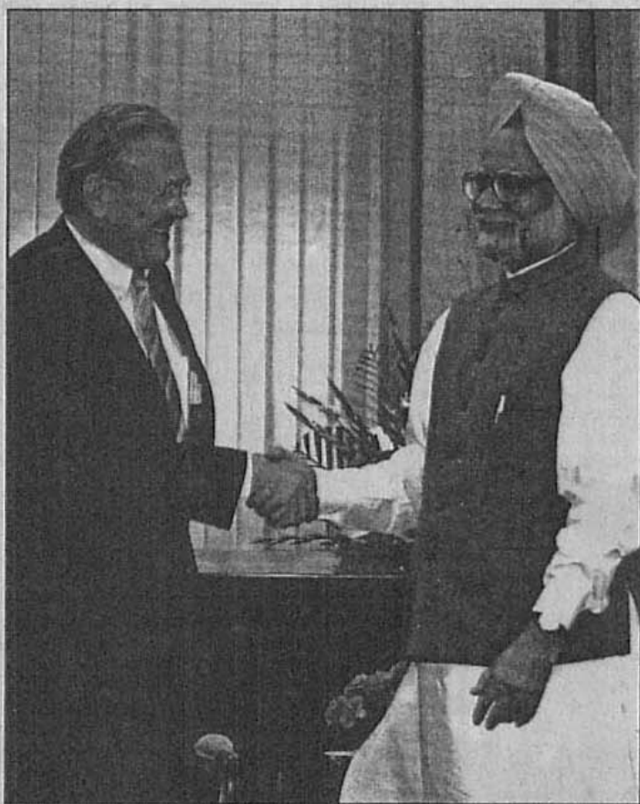
US Secretary of Defence Donald Rumsfeld (L) shakes hands with Indian Prime Minister Manmohan Singh in New Delhi yesterday. Rumsfeld said he would build stronger defence ties with India, a day after New Delhi warned Washington against selling warplanes and weapons to nuclear rival Pakistan.