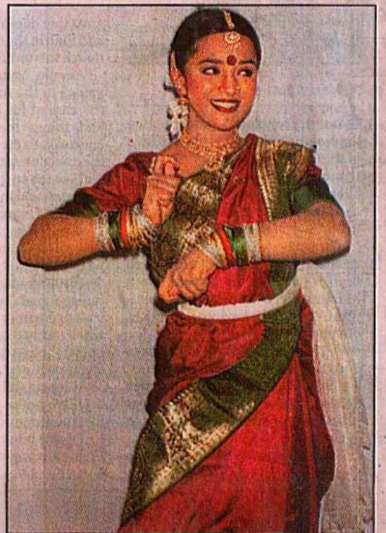
universal appeal. One can easily understand the mrudras of dance even if one does not understand the specific language.

According to Auvi, 'The newcomers are losing interest in dance because of a lack of promotion. Switching from dance they are mostly getting interested in modeling, which is quite distressing.' She says that dance is an ideal form of entertainment because, as she says, 'Dance has a