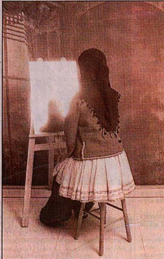
Two photographs by Shadi Ghadirian