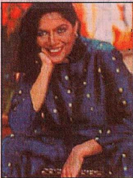
who has already started shooting The Namesake in Kolkata, where she is also learning Indian classical music. After completing The Namesake , Nair

'I was touched by the world depicted in the novel moving from Kolkata to Cambridge and then to New York,' said New York-based Nair