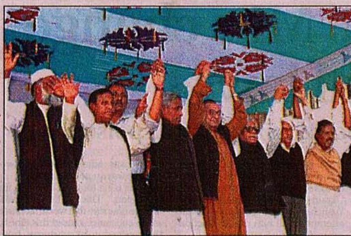
Opposition leaders wave to the people at a public meeting at Shaheed Khokan Park in Bogra yesterday. The meeting was organised by the 14 opposition political parties to make the December 11 no-confidence human wall programme a success.

In separate condolence messages, they prayed for the peace of the departed soul and conveyed sympathy to members of the bereaved family.