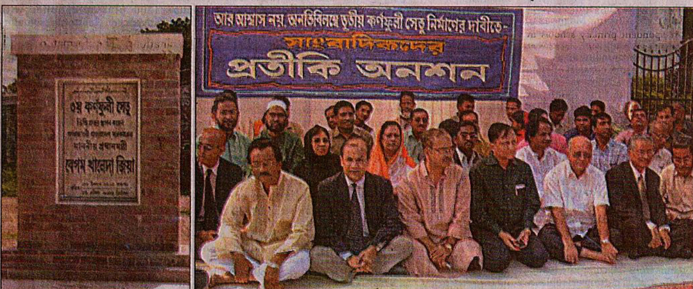
Local leaders of the ruling BNP-led four-party alliance express solidarity with the journalists, right, who staged a token hunger strike recently demanding immediate construction of the Third Karnaphuli Bridge and the foundation stone, left, of the bridge laid by Prime Minister Khaleda Zia on April 19 this year.

Govt rejects Dutch offers and lobbies for Kuwaiti fund