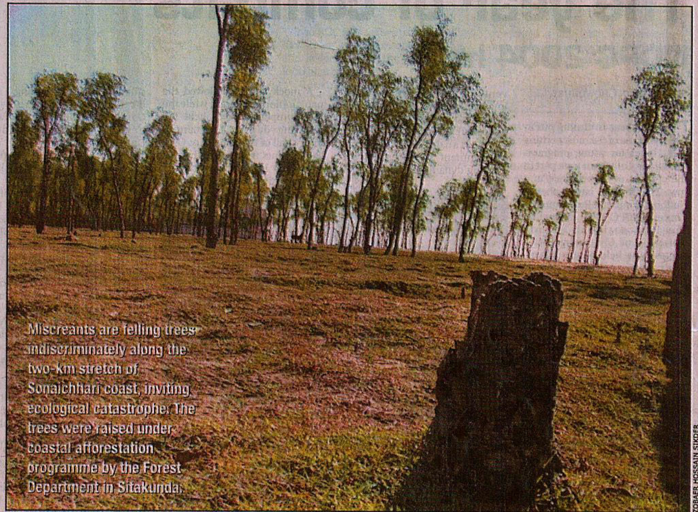
Miscreants are felling trees indiscriminately along the two-km stretch of Sonachhari coast, inviting ecological catastrophe. The trees were raised under coastal afforestation programme by the Forest Department in Sitakunda.