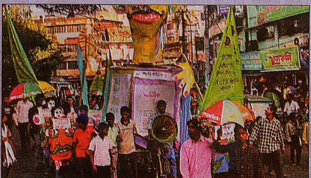
Women Development Agency of Bangladesh (WODAB) brought out a colourful procession in the city on Saturday to create awareness about violence against women.