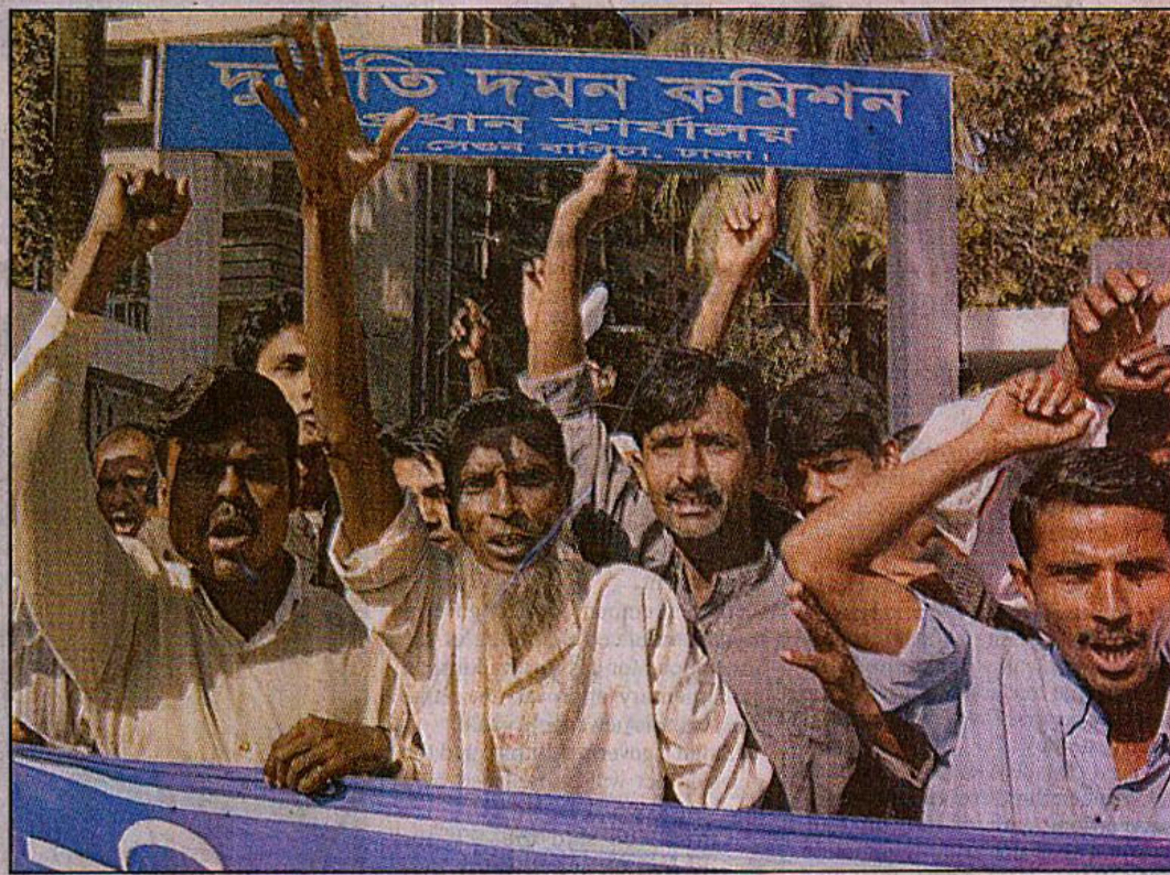
Gonotantik Olkya Jote stages a demonstration in front of the Anti-Corruption Commission head office in the city yesterday demanding steps to make the Commission effective.

Police arrested 1,371 people on various charges from different parts of the country in the last 24 hours till 6:00am yesterday.