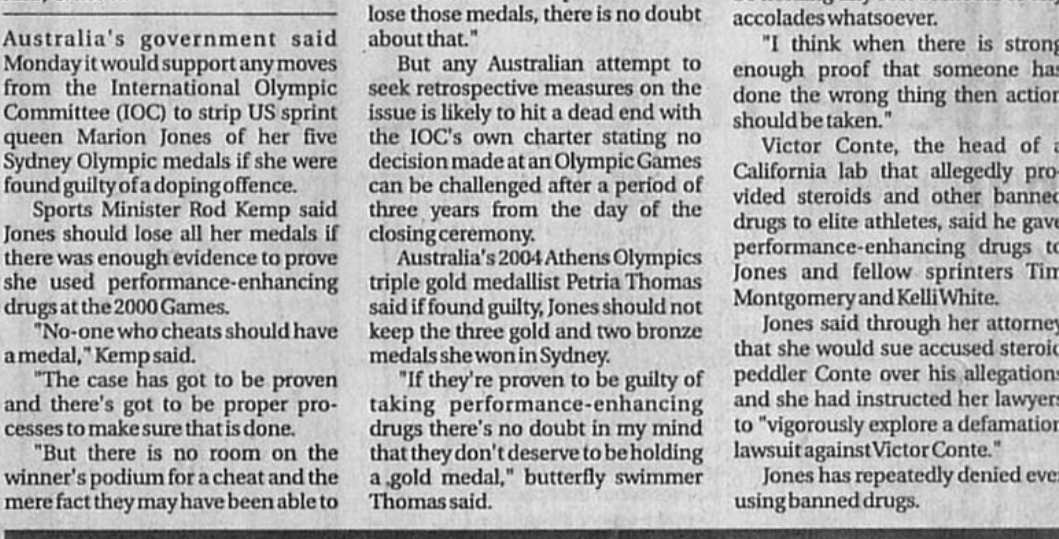
WHEN LIFE WAS BEAUTIFUL: A file photo of American Olympic champion Marion Jones competing in the 100 metres final at the 2000 Sydney Olympic Games.