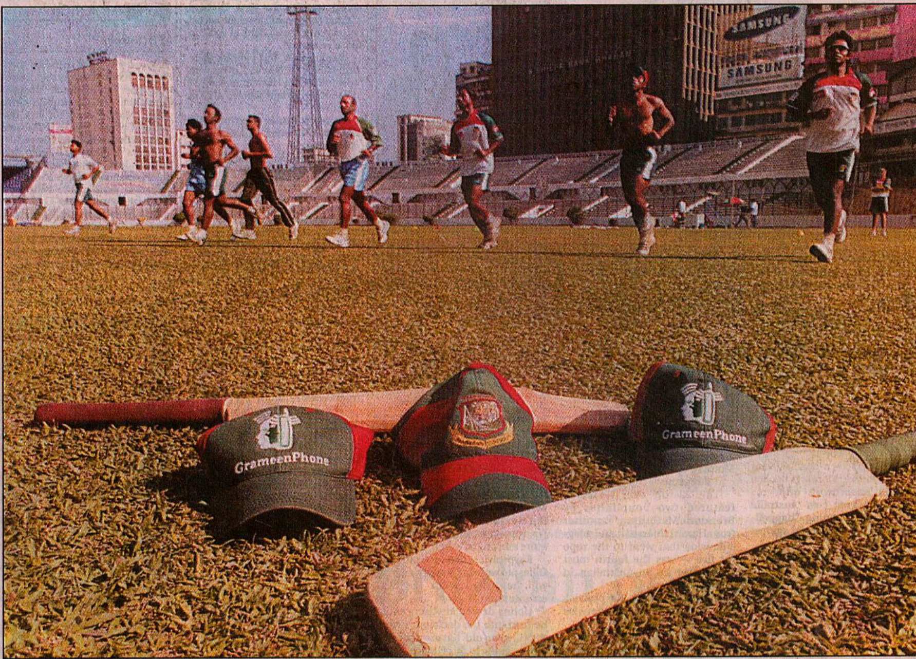
EVERYTHING BUT THE INDIANS IS READY: Bangladesh cricketers warm up prior to a practice session at the Bangabandhu National Stadium yesterday. Sourav Ganguly's India are scheduled to arrive here tomorrow to play in a full Test and ODI series.

But everything will fall into place once Sourav's men are cleared to come to Dhaka.