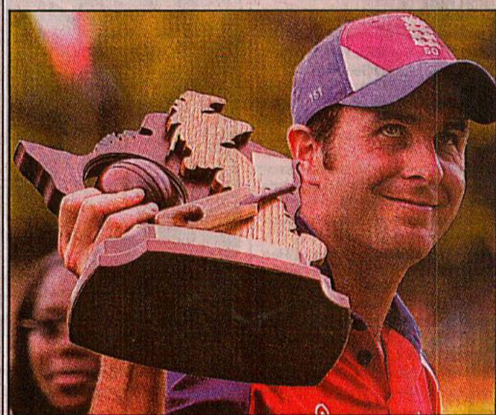
A smiling England captain Michael Vaughan shows off the man-of-the-series trophy after fourth and final one-day international against Zimbabwe in Bulawayo on Sunday.