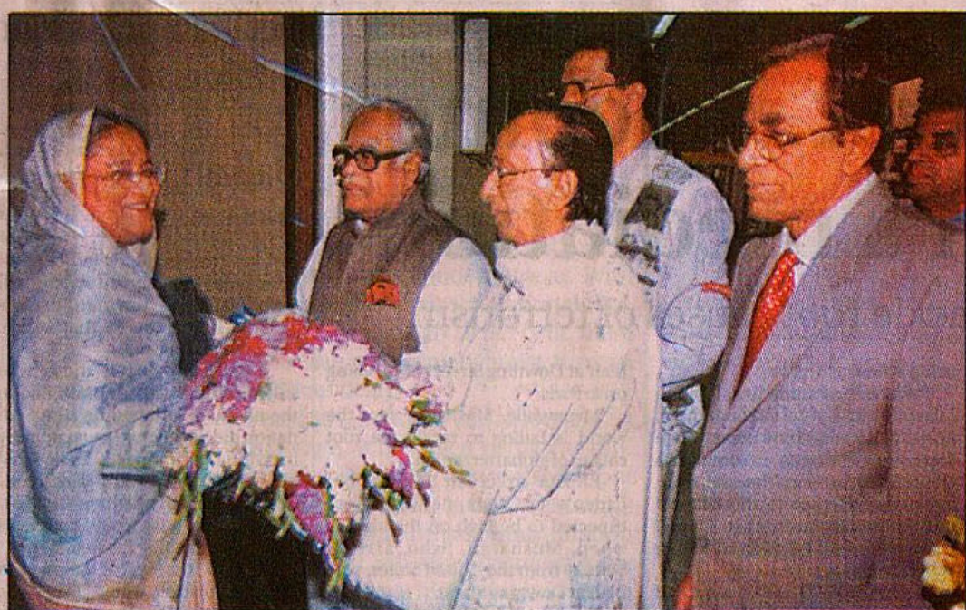
Awami League President and Leader of the Opposition in Parliament Sheikh Hasina was received by central leaders of the party yesterday upon her arrival at the Zia International Airport after a six-week visit to the United States and the United Kingdom.