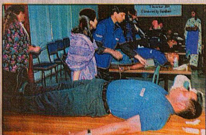
Unocal Bangladesh Dhaka office organised its annual blood donation programme on its premises recently. Unocal employees donated 40 bags of blood conducted by Sandhani Dhaka Medical College unit.