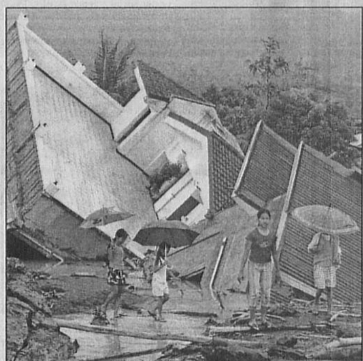
Children cross water near a house that collapsed to the river in Real town, Quexon province yesterday following the flash flood and landslides. Thousands were left homeless and about 1,400 dead and missing from the two storms that rampaged in the northeastern Philippines in one week.

Reviving violence-weakened bonds between moderate clerics and followers of different faiths holds the key to crushing Asia's formidable network of extremist militants, regional leaders said yesterday.