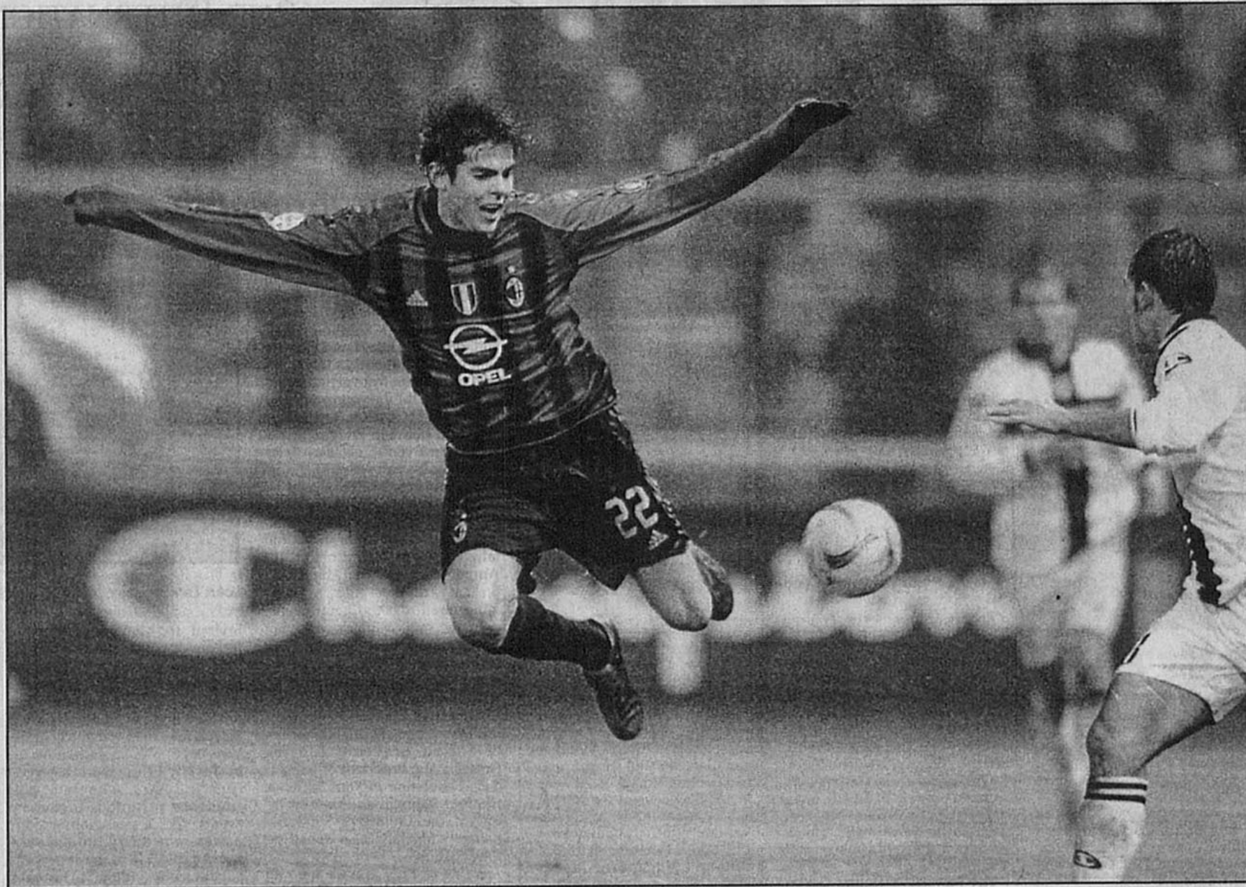
FLY AWAY WITH ME! AC Milan's Brazilian superstar Kaka is airborne during the match against Parma at the Tardini stadium in Parma on December 4.

Qatar has become a popular destination for still active world stars on the wrong end of 30. German international Stephen Effenberg, Spanish great Fernando Hierro and a host of other big names have brandished their trade in this oil-rich country.