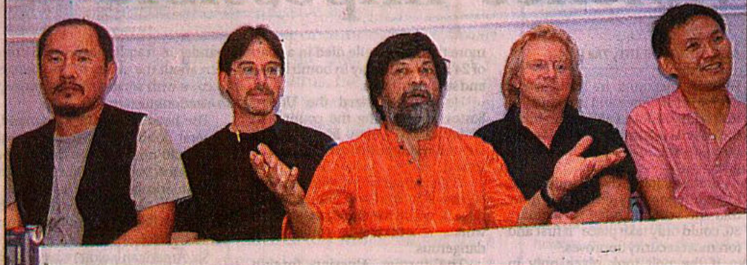
Festival Director Shahidul Alam, third from left, speaks at a press conference on Drik premises yesterday. The press conference was held on the occasion of the Third International Festival of Photography Asia 2004 Chobi Mela III.