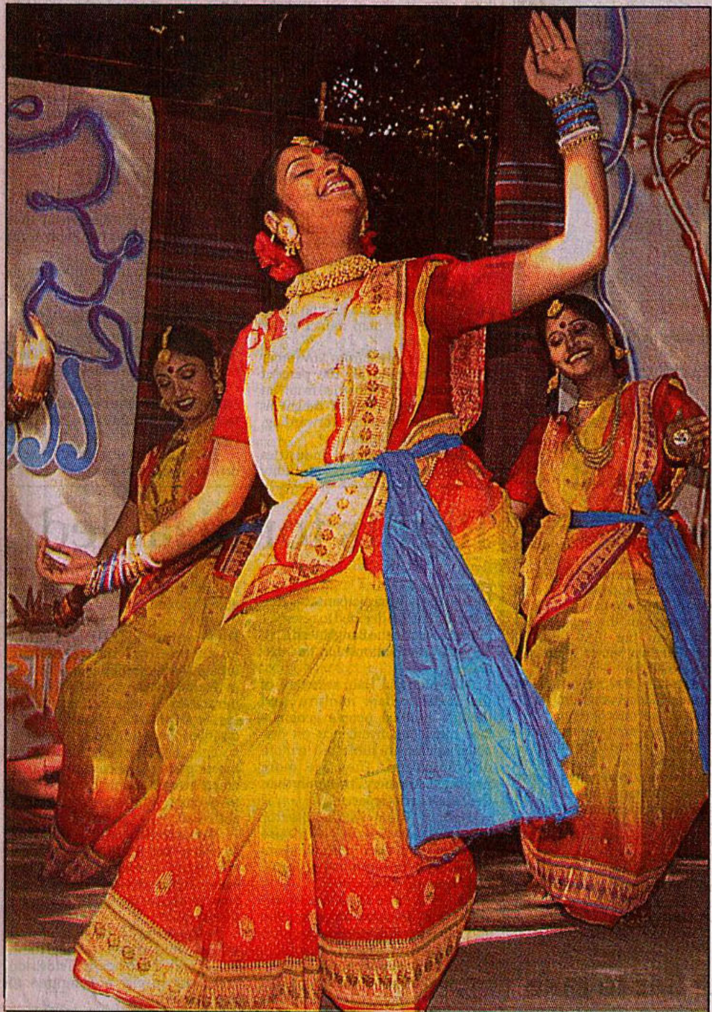
Dancers perform at a function at the Institute of Fine Arts in the capital yesterday, marking nabanna utsab (the traditional festival of rice harvest) organised by Jatiya Nabanna Utsab UjJapan Parishad.

See the Sticker before you Purchase Marketed by TRANSCOM ELECTRONICS On the Carton On the Product