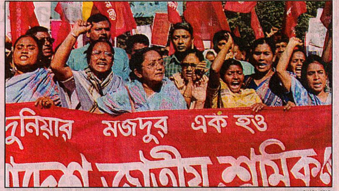
Bangladesh Jatiya Sramik Jote stages a demonstration in the city yesterday demanding reopening of closed mills and factories.