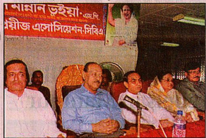
LGRD and Cooperatives Minister Abdul Mannan Bhuiyan speaks at the representatives' conference of Sonali Bank Employees Association in the city yesterday.

A fire fighter was also injured while extinguishing the blaze.