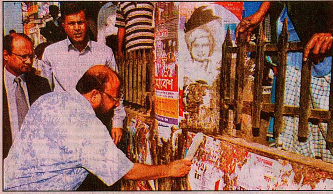
Dhaka City Corporation Mayor Sadeque Hossain Khoka removes a poster from a wall while he was visiting different areas of the city yesterday to see the progress of the DCC's clean-up drive.