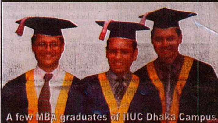
A few MBA graduates of IIUC Dhaka Campus

Download admission form - www.iiucdc.net