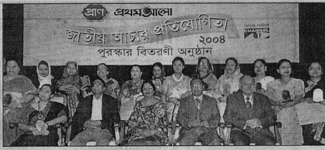
Winners of Pran-Prothom Alo National Pickle Competition-2004 pose with the guests at the prize giving ceremony.