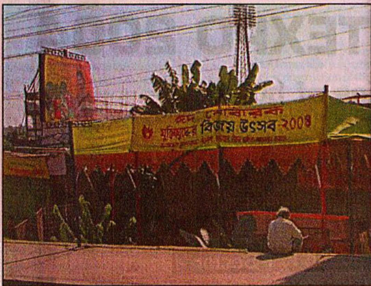
Pro-government Bijoy Utsab Udjapan Parishad sets up its office (left) and erects makeshift stalls on Outer Stadium premises.