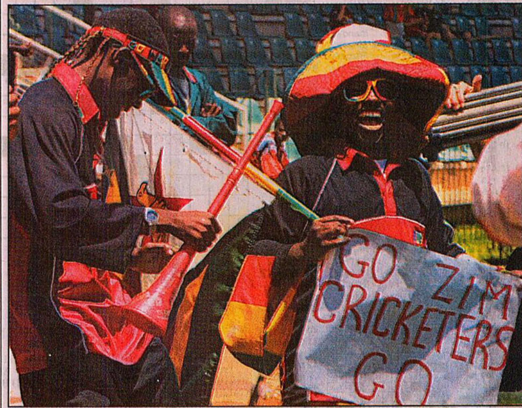
NEVER LOSE HOPE: Two Zimbabwean fans cheer their inexperienced side in the first ODI against England at Harare yesterday.