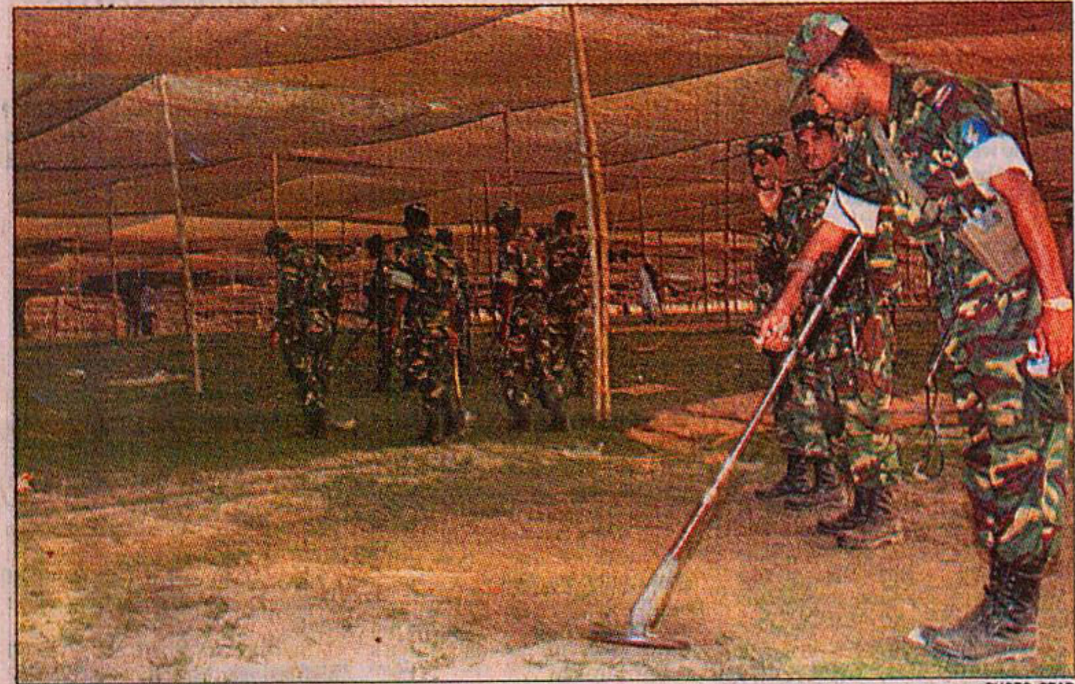
Army men use an explosives-detecting device to scan the Biswa Jitema ground in Tongi yesterday, four days to the second biggest Muslim congregation after the Hajj.

Private entrepreneurs would meet the rest of the deficit through imports, he added.