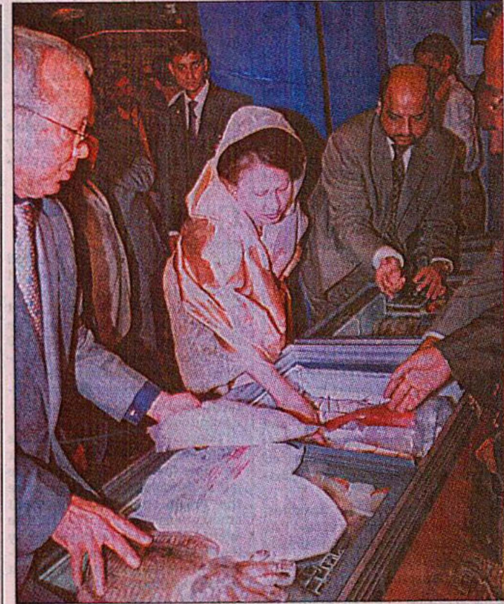
Prime Minister Khaleda Zia catches a glimpse of shrimps after inaugurating the two-day Bangladesh Seafood Expo 2004, at Sonargaon Hotel in the capital yesterday.