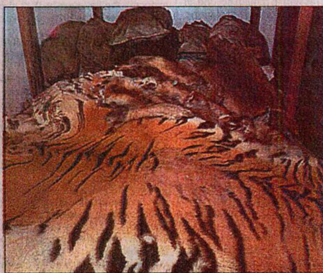
Tiger skin remains as a symbol of vanity.