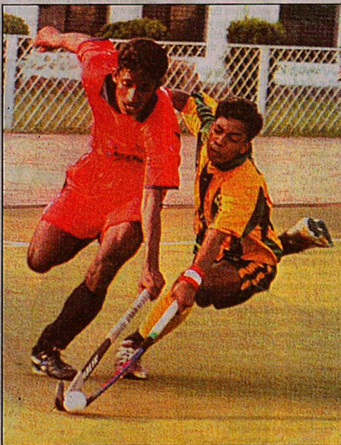
A Mariner (L) and one of his Sonali Bank opponents are in pursuit of the ball during their Green Delta Premier Division Hockey League clash at the Maulana Bhasani National Stadium yesterday.