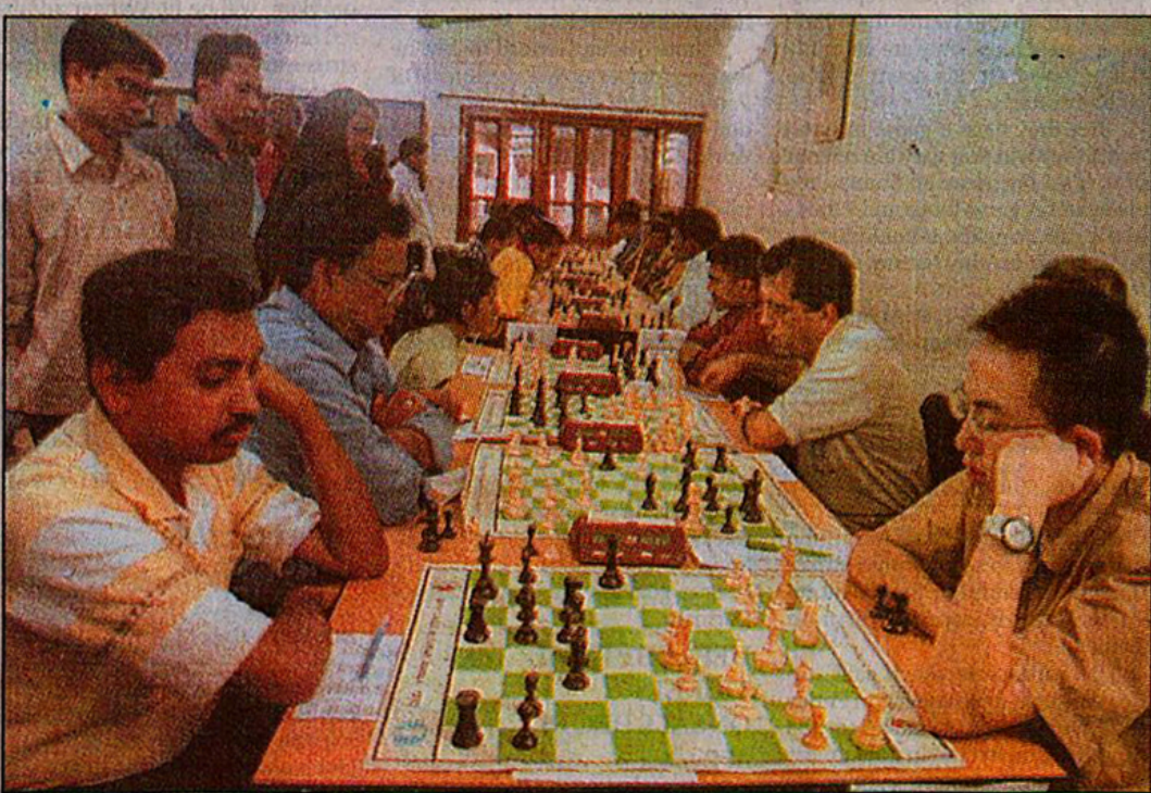
Scene from the third round of the Dutch-Bangla First Division Chess League at the federation hall room yesterday.