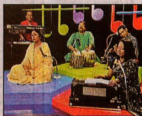
Bhalobasho Mor Gaan

On ntv at 8:50pm Musical Programme Hosted by Ferdousy Rahman