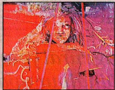
Red Sorrow, oil on canvas

white. In Shy aware one comes across another female figure done shades of brown, burnt sienna and white. This too is lyrical.