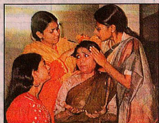
The mother and her three daughters in the play Mukti

The premiere show of the play starts just after the inauguration ceremony of the festival at the Experimental Theatre Stage.