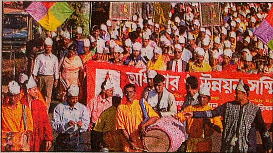
A colourful procession was brought out in Chittagong yesterday marking the inauguration of a three-day conference, on 'Rights and Development'.