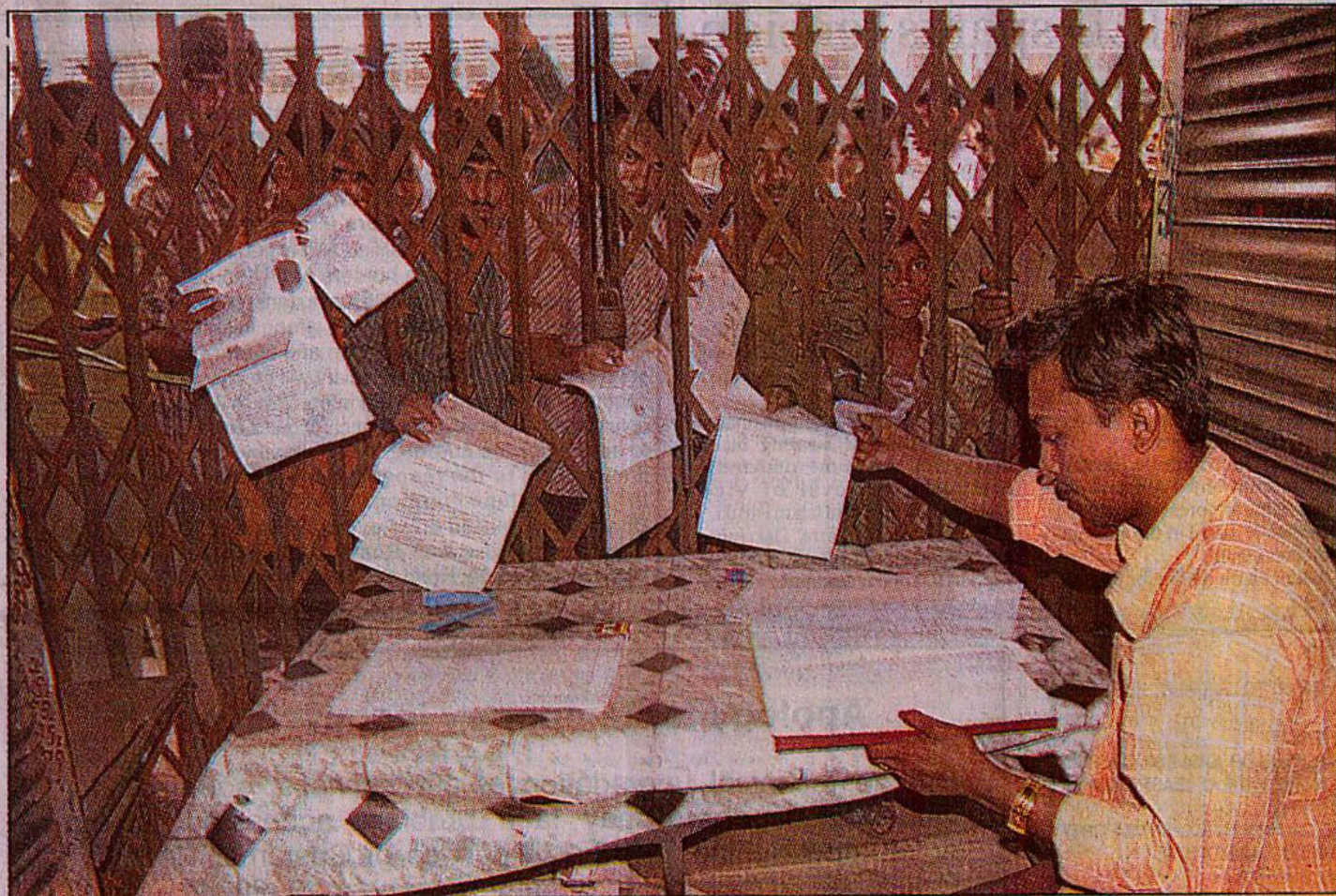
Officials of New Bangabazar Hawkers' Market Committee yesterday receive documents from the shop-owners affected by Sunday's devastating fire at the market. The committee has started assessment of the shop-owners' losses.