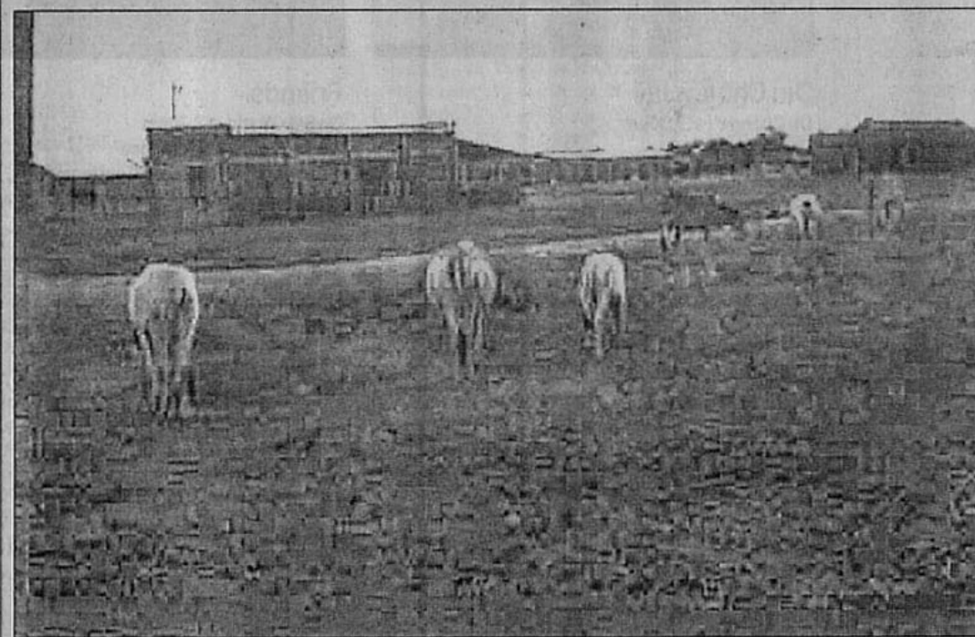
Cattle grazing inside Satkhira BSCIC Industrial Estate. Lack of entrepreneurs' interest, other factors behind failure of the Tk 3 cr project.

At least 2,500 job opportunities would be created if industrial units are grown here in a planned manner.