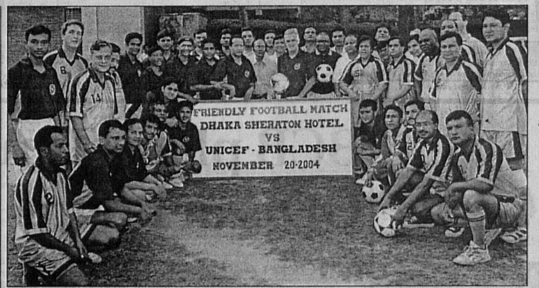
Players and officials of Dhaka Sheraton Hotel and UNICEF Bangladesh pose for photographs before their friendly football match at the Notre Dam College ground on Saturday. Sheraton won 7-0.

Pakistan pace bowler Shabbir Ahmed will not be considered for next month's Test series in Australia because he has yet to recover from a knee operation, captain Inzamamul Haq said on Sunday.