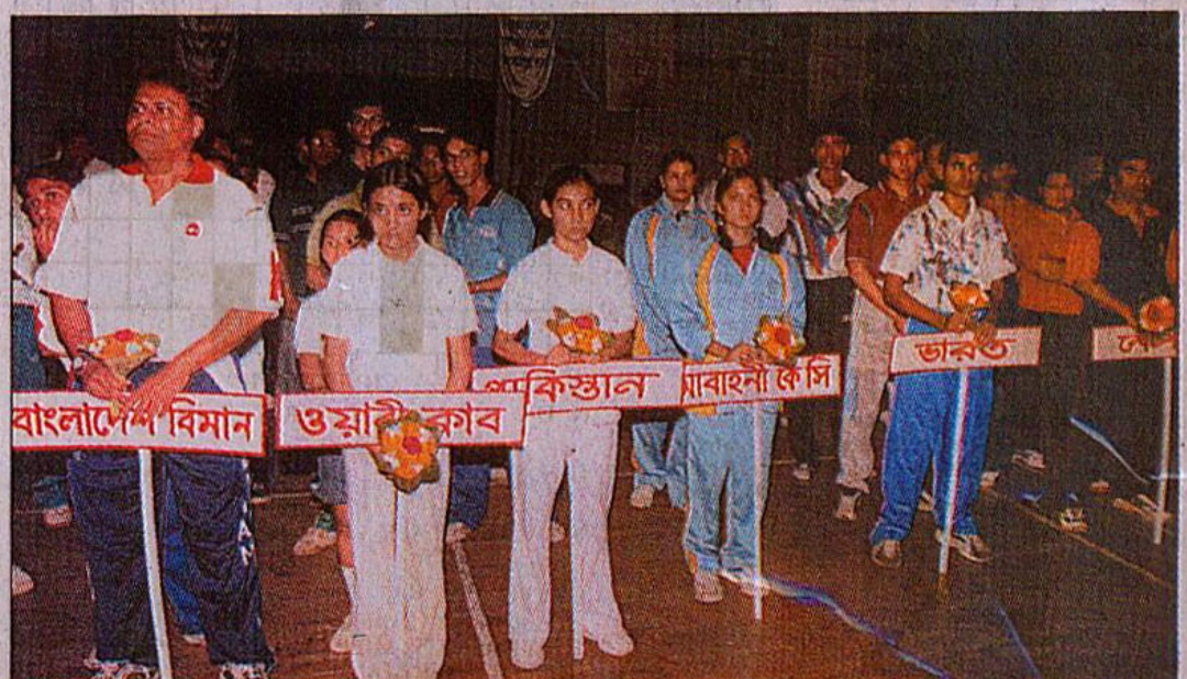
Participants of the Beximco Pharma Abul Hashem Memorial Table Tennis Championship listen to the opening address at the outer stadium wooden-floor gymnasium yesterday.