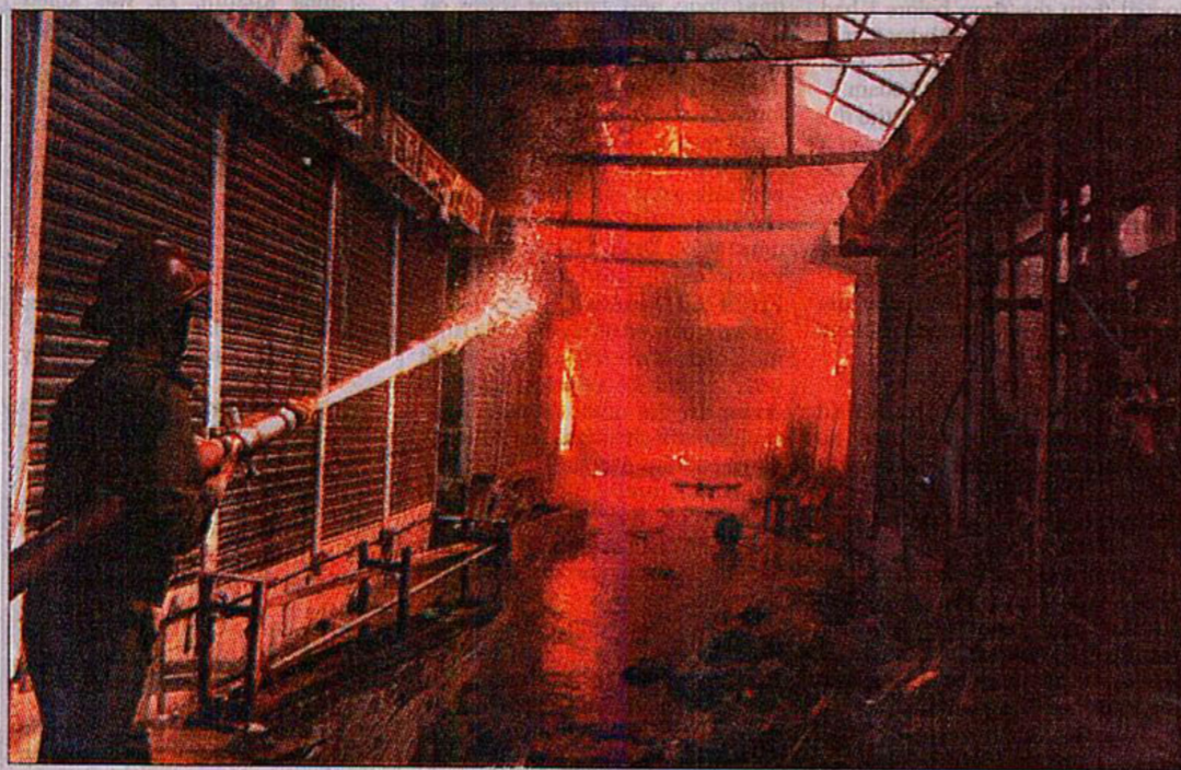
A fireman, left, sprays water on burning shops at New Bangabazar Hawkers' Market in Gullistan yesterday and owner of a shop, right, hauls a bundle of recovered clothes to safety.