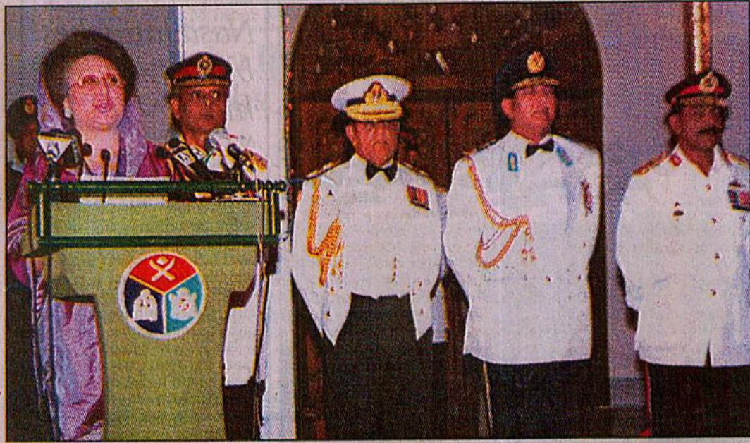
Prime Minister Khaleda Zia addresses a reception arranged on the occasion of Armed Forces Day at Senakunja in Dhaka Cantonment yesterday.