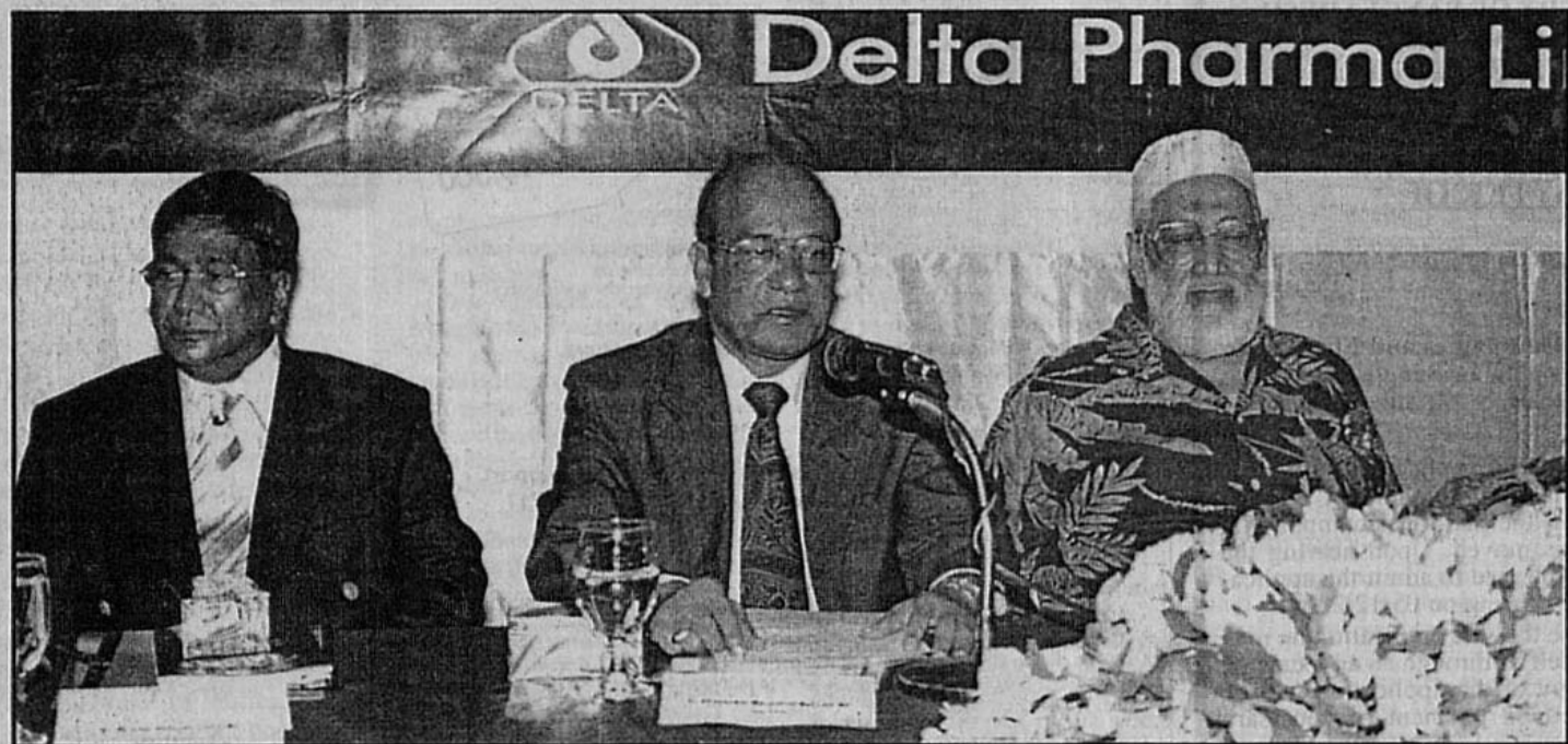
Health and Family Welfare Minister Khandkar Mosharrar Hossain (Centre) attends the launching ceremony of Delta Pharma Ltd in Dhaka yesterday. State Minister of the ministry Mizanur Rahman Sinha (Left) and former advisor to caretaker government Prof MA Majed are also seen in the picture.

GP, the leading mobile phone operator in Bangladesh, has crossed the two-million subscriber mark recently.