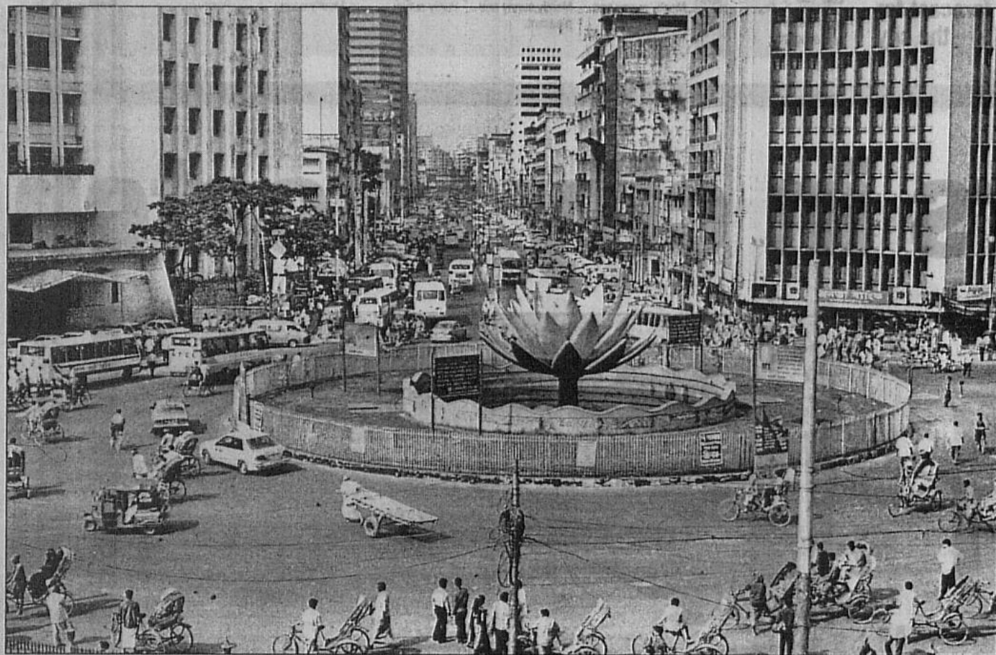
The city experienced a very thin traffic during the six-day Eid holiday.