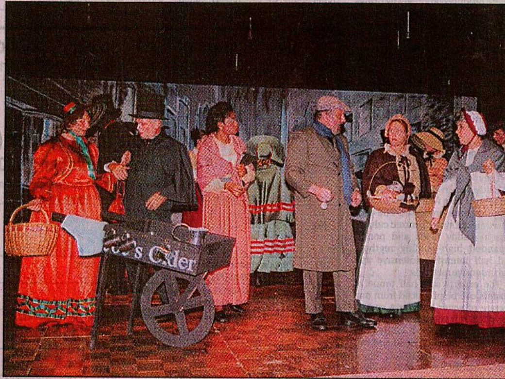
A sequence from the play A Christmas Carol by Dhaka Stage

Late on Christmas Eve, Scrooge is visited by the ghost of his business partner Marley, who died