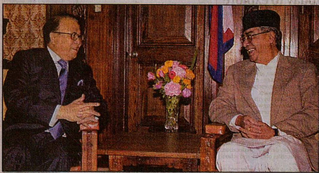
Foreign Minister Morshed Khan, left, speaks to Nepalese Premier Sher Bahadur Deuba in Kathmandu Friday after handing over an invitation from Prime Minister Khaleda Zia to attend the upcoming Saarc Summit in Dhaka.