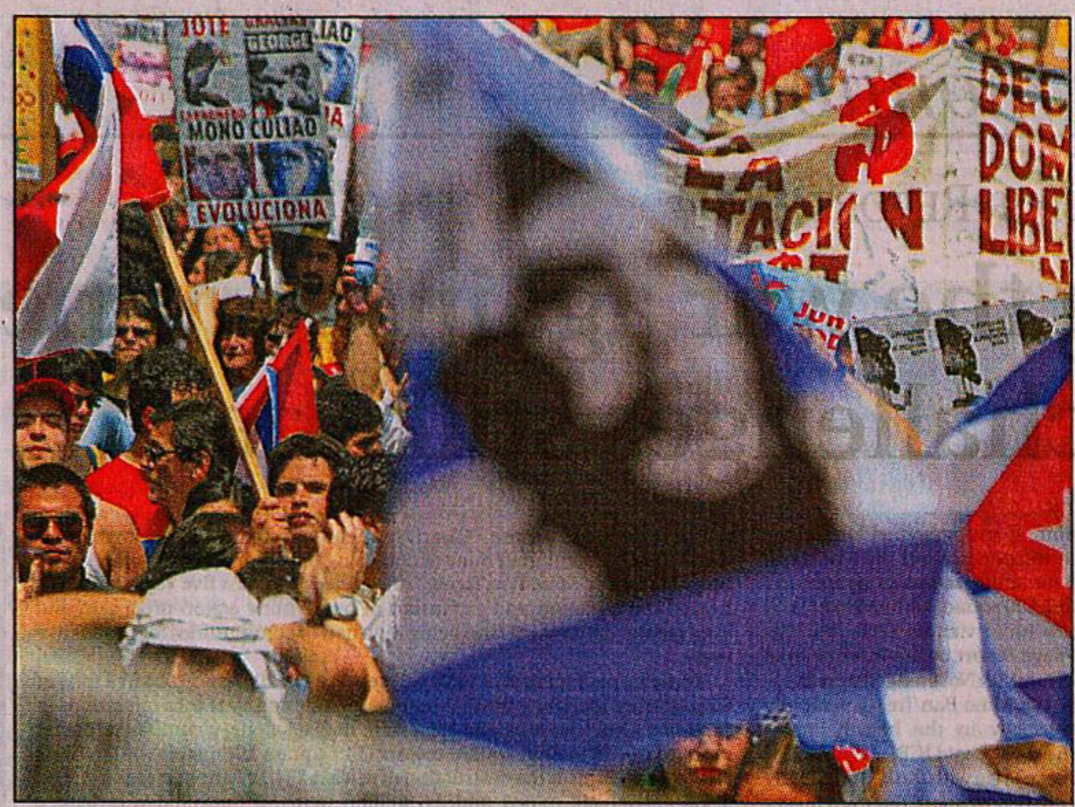
Protesters march during a demonstration against the Apec Forum and US President George W. Bush's visit to Chile Friday in Santiago. Chilean anti-riot police fired water cannon and tear gas at stone-throwing protesters in a massive rally against a major Asia-Pacific summit.

The BJP said yesterday it has severed its ties with the AIDMK for the way the Jayalalithaa government in Tamil Nadu handled the arrest of Kanchi Shankaracharya Jayendra Saraswati in a murder case.