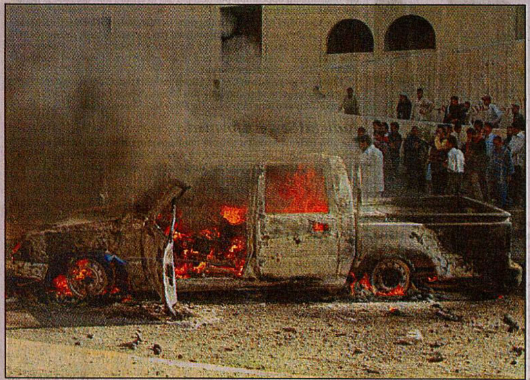
An Iraqi civilian car is caught in fire following a suicide bomb attack in Baghdad yesterday. The explosion erupted in the center of Baghdad, sending a plume of black smoke into the sky.

Hooded anti-American marchers protesting an Asia-Pacific summit in Chile Friday hurled Molotov cocktails and stones at police who retaliated with water cannons and tear gas.