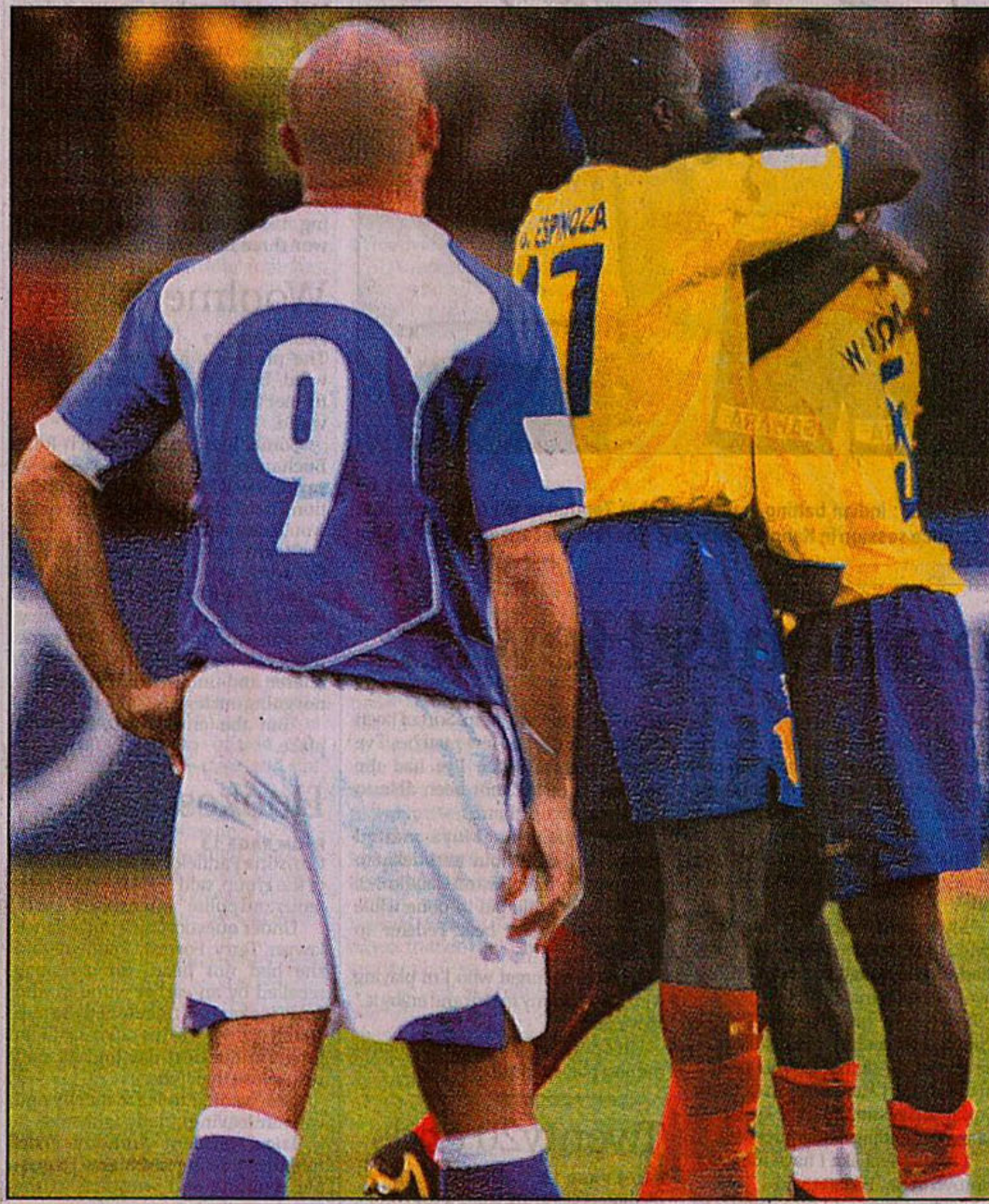
A TASTE OF OWN MEDICINE: Superstar Ronaldo looks on as Ecuador players celebrate their winner against Brazil at the Atahualpa Olympic Stadium in Quito on November 17.