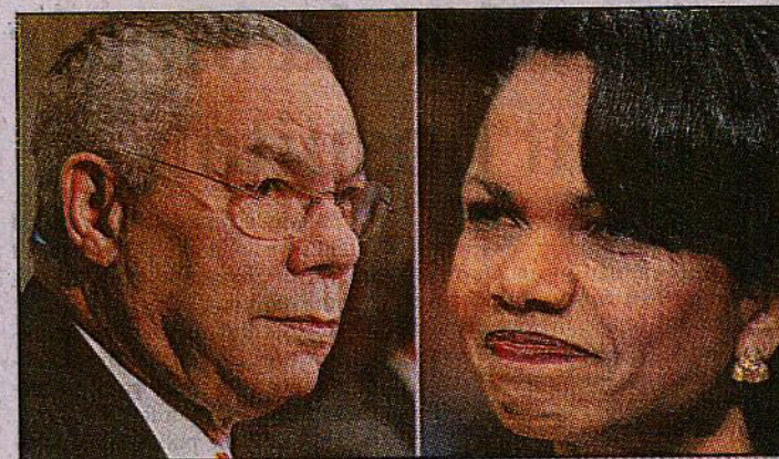
US President George W. Bush named National Security Advisor Condoleezza Rice, right, to succeed Secretary of State Colin Powell, left, who resigned November 15 during a press conference at the White House Tuesday.