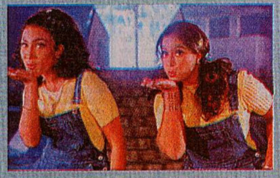
Prem Korechhi Besh Korechhi on ATN Bangla at 3:40pm on the Eid day