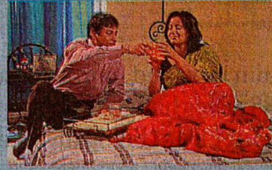
Telefilm Inggeet will be telecast on the second day of Eid at 10:30 pm on ntv