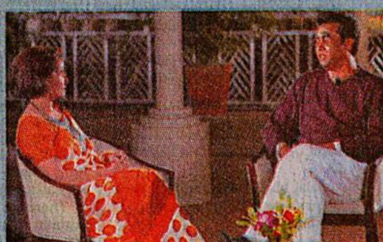
Talk show Alochon will be aired on ntv at 9:50 pm on the third day of Eid