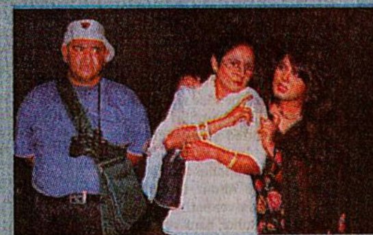
Cox's Bazarey Koyekjon will be on ATN Bangla at 9:00pm on the second day of Eid