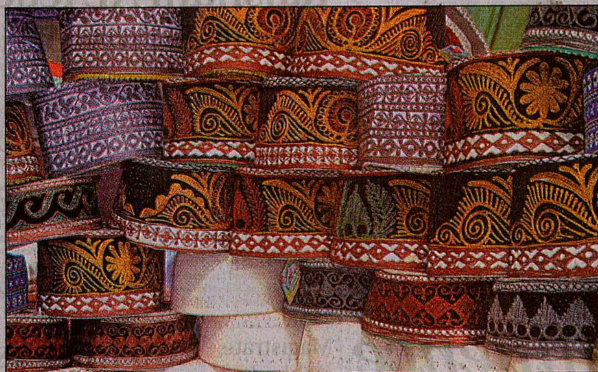
Topis depict intrinsic designs besides the simple white coloured ones

Made of precious materials like ivory, amber, seashell, turquoise, coral, crystal, even gold, silver and various types of wood, the colourful and exotic tasbih of 100 beads is the Muslim prayer beads. Akin to the Christian rosaries, Greek's komboloi, Buddhists' malas, Muslims