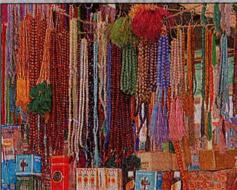
An array of colourful tasbih on display

have tasbih that originated from Istanbul. Counting the tasbih has been a part of