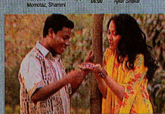
ATN Bangla will telecast musical programme Asha Chhilo at 10:30pm on the third day of Eid