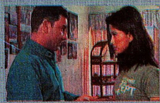
Drama Shada Kalo Projapati will be seen on Eid day on Channel i at 9:30pm