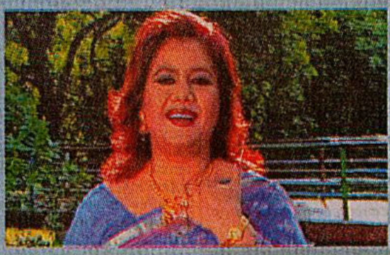
Runa Laila Exclusive will be aired on the third day of Eid at 10:30pm on BTv