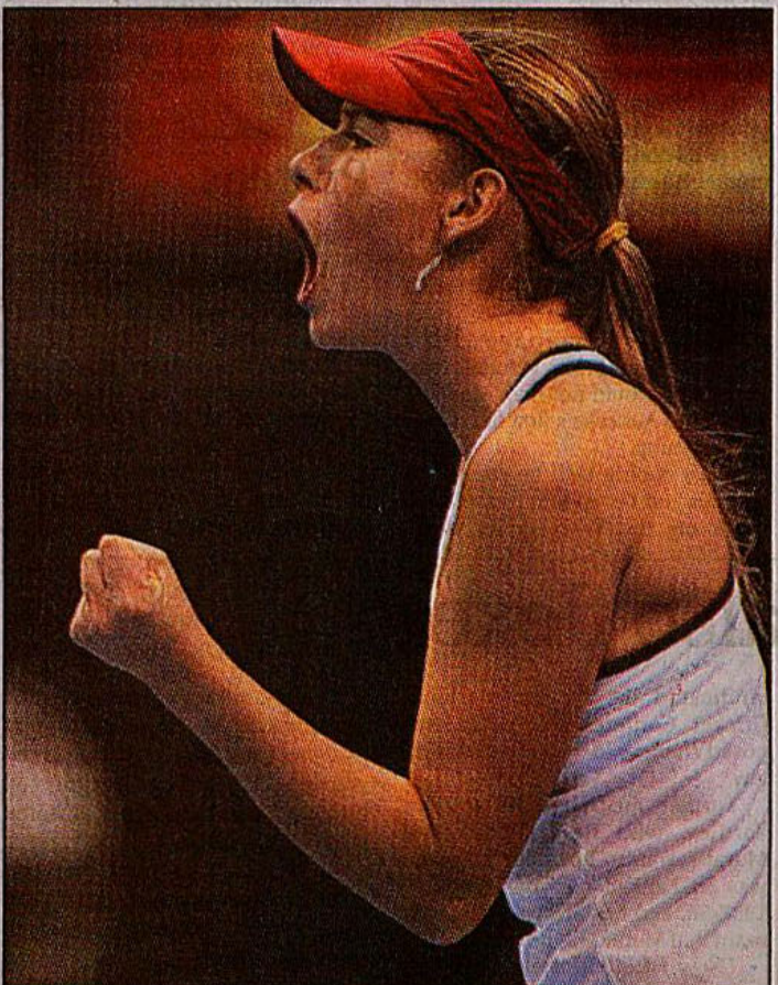
Russian Maria Sharapova roars after winning against compatriot Svetlana Kuznetsova at the WTA Tour Championships in Los Angeles on November 11.