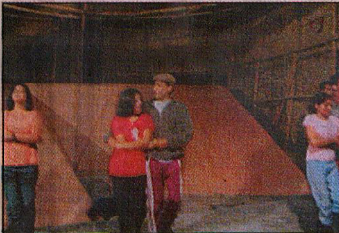
A glimpse of a rehearsal of the play

CAT will stage the premier show of Brand on December 18 at the Experimental Theatre Stage.