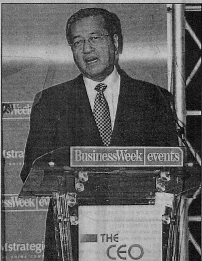
Mahathir Mohamad, former prime minister of Malaysia, delivers his keynote address at the closing of the Businessweek CEO Forum, in Beijing yesterday. Mahathir spoke on a topic entitled "The Leadership Edge: Building the Future of Asia".

"The American people are, by and large, very ignorant and know nothing about the rest of the world. They think that America is the world," he said.