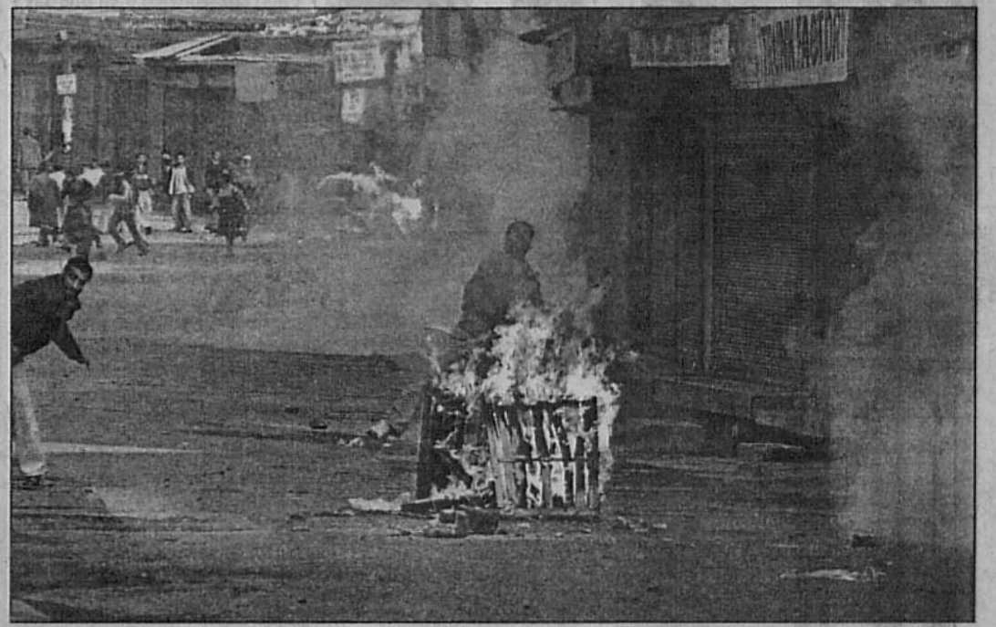
Kashmiri Muslim men hurl rocks at policemen in clouds of teargas during a protest in Srinagar, yesterday. Several people were hurt when police baton-charged a group of Kashmiris protesting at the alleged rape reported over the weekend of a Muslim girl and her mother by Indian troops, police and witnesses said. Clashes broke out after several hundred Muslims, mostly youths, took to the streets chanting anti-government and anti-army slogans.

Mehbooba Mufti, daughter of Kashmir Chief Minister Mufti Mohammed Sayeed, and president of the regional ruling Peoples Democratic Party, branded the alleged incident "brutal and shameful".