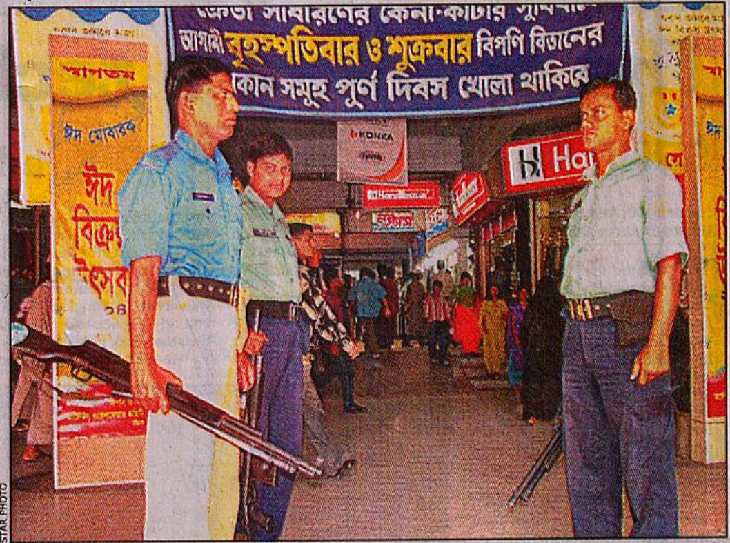
Police guard almost all shopping arcades and malls in the port city to ensure security of Eid shoppers and the shop owners.