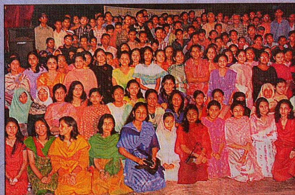
The GPA-5 achievers in this year's HSC examinations under Chittagong Education Board pose with the guests at Chittagong Muslim Institute auditorium on Thursday.

Later, the chief guest distributed prizes and certificates among around awardees.