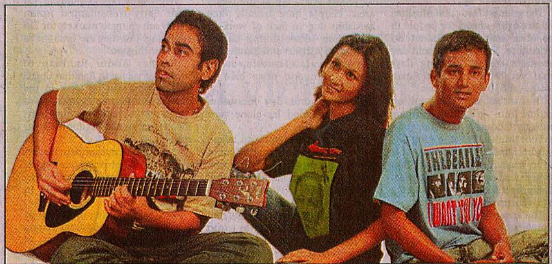
Eye-catching motifs on T-shirts

So for those shoppers looking for new gift ideas or in search of a new addition to their wardrobes, these reasonably priced thematic T-shirts are the best answer.