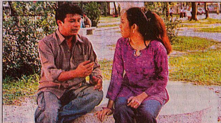
A scene from the telefilm Babodhan