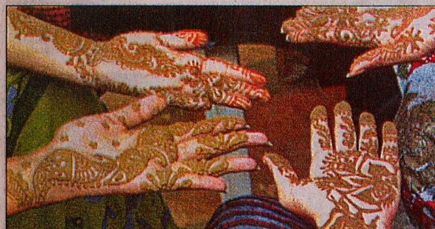
Delicate designs on palms