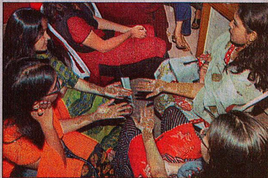
Girls waiting patiently for best colour effect

Apart from this, computer graphic designs are also used with the traditional mehendi designs. Traditional Arabic designs of mehendi have now become popular. Wonderful designs make the art of mehendi more attractive and beautiful.